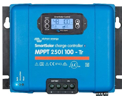
SmartSolar Charge Controller MPPT 250/100-Tr with optional pluggable display