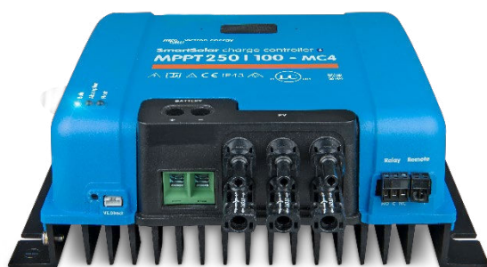
SmartSolar Charge Controller MPPT 250/100-MC4 without display